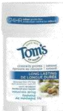
Tom's Men's Deodorant