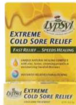
Lypsol Cold Sore Relief $9.99

Winter is harsh and cold sores come running which is why Lypsol products have endured the test of time, helping you get relief that is pain free. Visit Lypsol's Facebook Page .