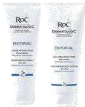
RoC Moisturising Cream for Dry Skin Face and Body