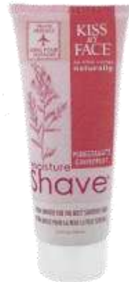
Kiss My Face Facial Shave Cream