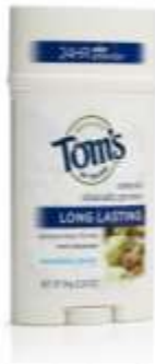
Tom's of Maine Long Lasting Deodorant - Mountain Spring

Since 1970 Tom's of Maine has been providing natural soaps, deodorants, toothpastes and more. That's over 40 years of service of a brand worth trusting geared at providing product people believe in. Visit Tom's Facebook Page