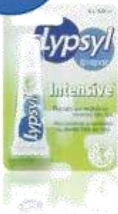
Lypstyl Intensive Lip Balm