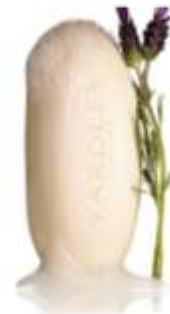
Yardley Soap Lavender Scent $2.99

Trusted for generations, Yardley soaps are crafted with essential oils and skin caring ingredients that help smooth your skin and soothe your mind. Visit Yardley's Facebook Page .