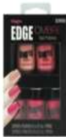
Fing'rs Edge Ombre Pink Nail Kit $12.99

Nails Polishes with flare, color and easy to use and enjoy. Women will enjoy Fing'rs Edge products. Groovy designs, nail tips and more can be found on Fing'rs Edge Facebook Page .